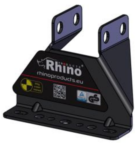
MS168 x 4