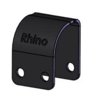
MS201 x 4